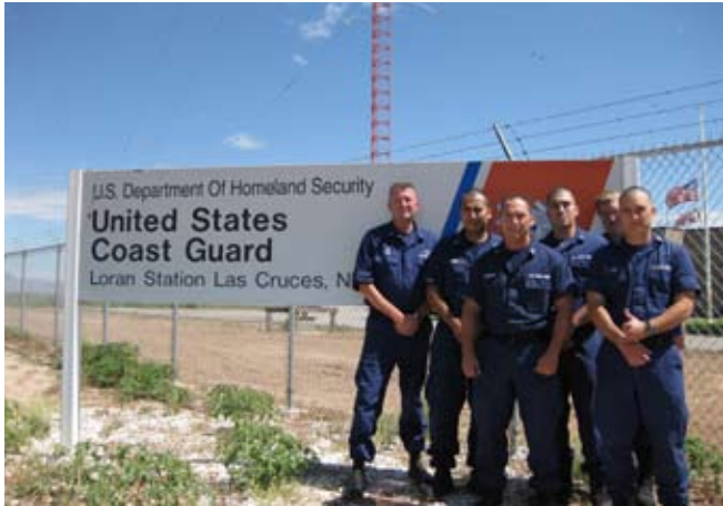
The station crew at the transmitter site at Las Cruces, New Mexico in 2008. Las Cruces was one of the 19 stations decommissioned on February 8, 2010.

In the end, however, none of these arguments were enough to save LORAN. Several inescapable facts remained: GPS worked better and LORAN equipment had been largely discontinued due to the popularity of GPS, thus very few LORAN users remained. The new eLORAN system would have certainly narrowed the gap between GPS and LORAN performance, but it faced a classic “chicken and egg” type of problem. Receiver manufacturers were understandably reluctant to build new equipment without any long-term commitment to eLORAN from the federal government. And without new receivers, it was nearly impossible to demonstrate the performance or utility of eLORAN.